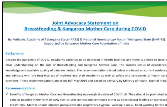
Figure 5: Special Focus Kangaroo Mother Care & EIBF