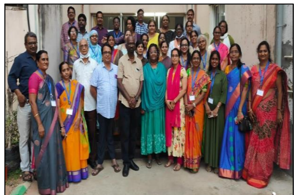
Figure 9: Training of Trainers (ToT) by BPNI & NHM Telangana