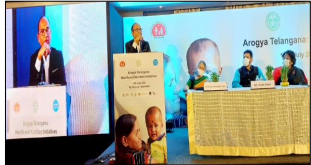
Figure 7: Regional Meeting by MoHFW Launch of BPNI Accreditation for MCH Units