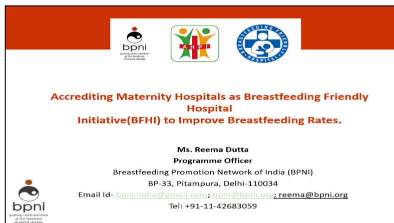
Figure 2: Overview of the Accrediting System of Maternity Hospitals as Breastfeeding Friendly Hospital Initiative (BFHI)