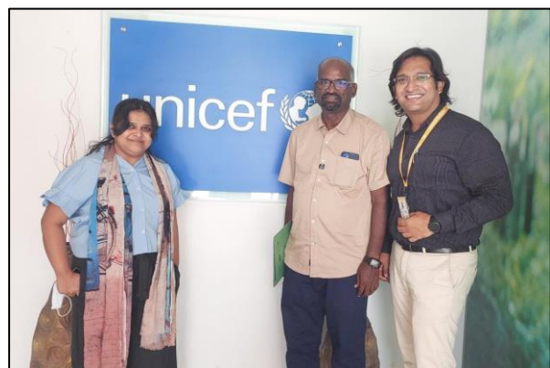
Figure 6: Mentoring visit by BPNI Mentor Field Assessments