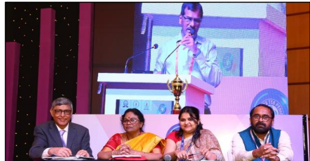
Figure 10: Pedicon 2022 - Panel Discussion IAPTCB Journal - Special Issue on Breastfeeding