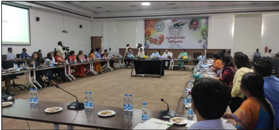
Figure 8: Partners' Meeting by Chief Secretary BPNI Accreditation taken up by NHM