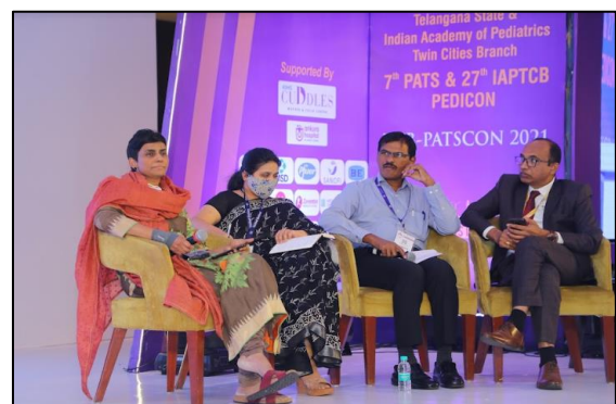
Figure 4: Pedicon 2021 - Panel Discussion IAPTCB President's Action Plan